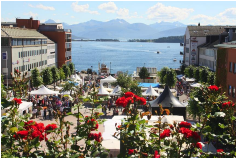
Molde, the city of roses

As we sail further along the coast, you realise the importance of fish to Norwegian coastal communities, and our next stop, Kristiansund , is referred to as Norway's 'dried cod capital'. From here we continue to Molde (Norway's "City of Roses") and Ålesund , noted for its concentration of Art Nouveau architecture, where we arrive shortly after midnight.