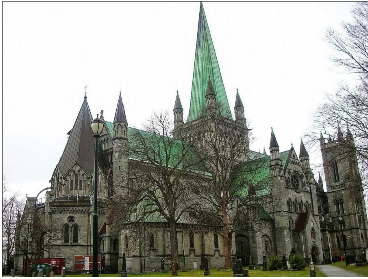
Nidaros Cathedral, Trondheim

Already at 06:30 we arrive in the city of Trondheim . We do not depart until 10:00, which provides an opportunity to visit this historical city founded by Viking King Olav Tryggvason in AD 997, and occupies a special place in Norwegian culture and history. Trondheim is also an ecclesiastical centre, a regional capital, a centre for industry and commerce, and an important education and research centre.