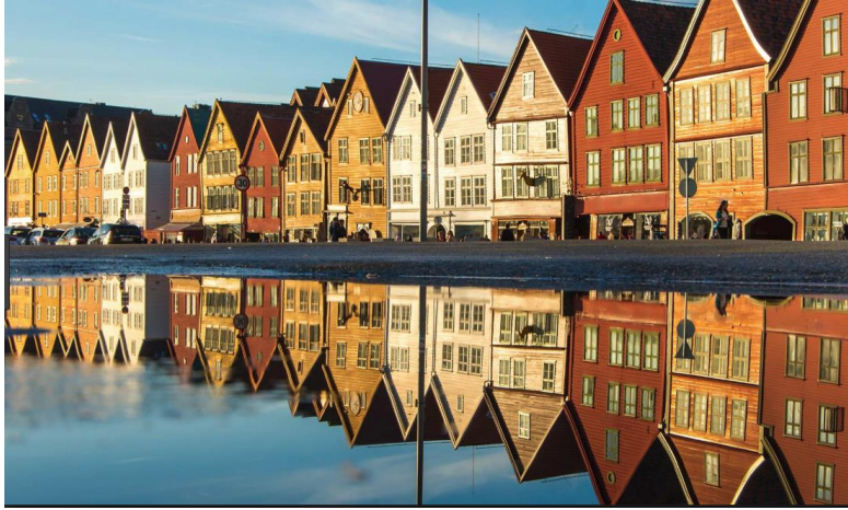
Bergen, the pier

Now the world's most beautiful voyage draws to a close, but before we dock in Bergen , there are some nautical miles of fascinating scenery ahead of us, including the picturesque Nordfjord below the enormous Jostedal Glacier. Finally, you disembark in Bergen at 14:30, taking with you memories of a unique journey filled with unforgettable experiences, and above all, lots of interesting presentations and discussions of the mitochondrial processes providing our organism with life-giving energy.